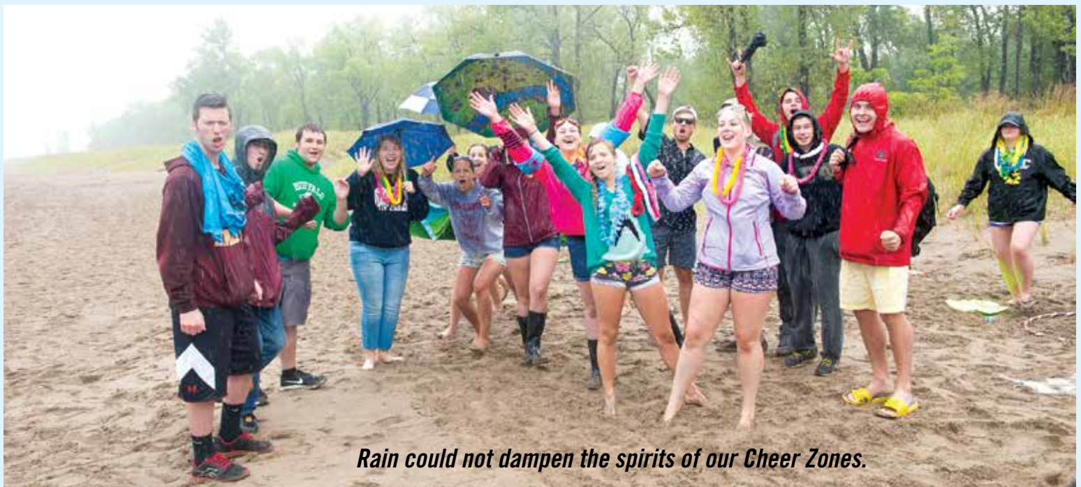
Rain could not dampen the spirits of our Cheer Zones.

And if you sign up to fundraise, you will get a free or reduced registration and be eligible for great prizes. Information is at www.BarberBeast.org