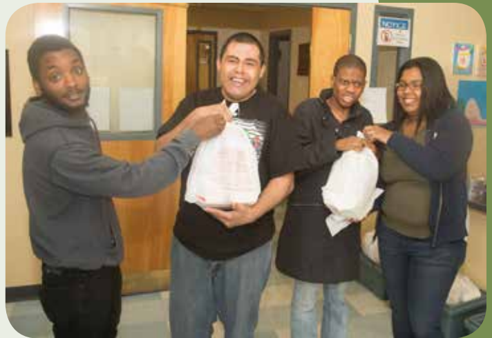
Making weekly deliveries for Meals on Wheels is one of the volunteer options for the Community Endeavors program.

Community Endeavors was developed more than five years ago after discussions with individuals,