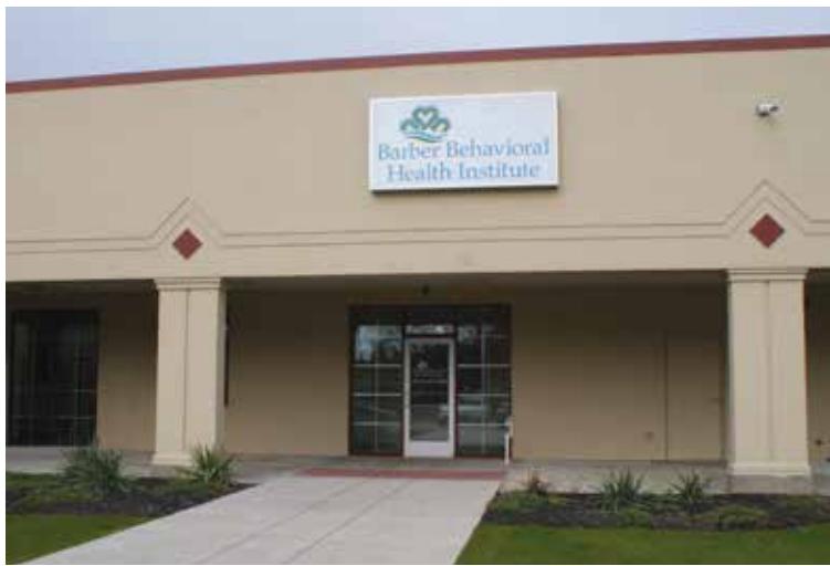
The Barber Behavioral Health Institute Outpatient Clinic is conveniently located at 1621 Sassafras Street in Erie.