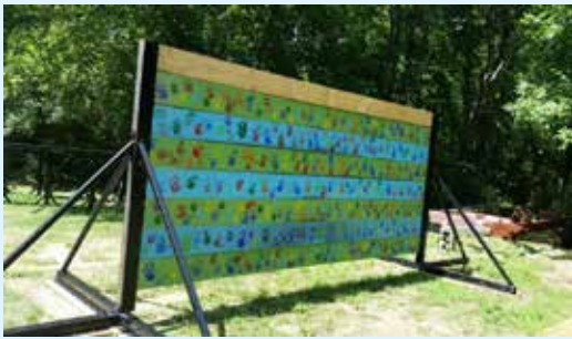
Participants will be reminded of why they are doing the event in the first obstacle, "One Bell of a Start." They will be climbing across panels painted by students at the Barber National Institute.